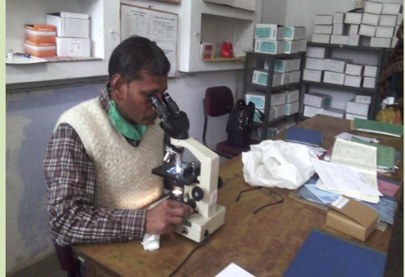
Microscopy by Lab Technician at DMC Sec10

They are socially, economically backward and marginalized. Health facilities in this area are very pathetic. People are suffering due to lack of basic civil facilities. The population of this area cannot be accurately censured because of the frequent in and out of people from this area. The development of women and children residing in the target area are in risk due to lack of health and educational facilities. Majority of the population belongs to lower class. The living condition is also pathetic. Half of the children in this area below 14 yrs are going for work. And DMC Saidnagali is covering very remote of the rural area. There are lack of health facilities and awareness.