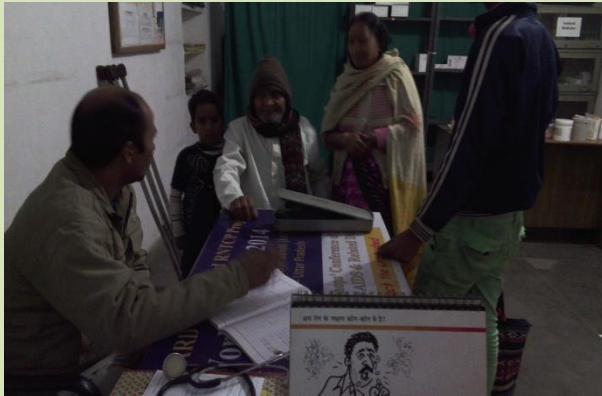
Diagnosis by Medical Officer at DMC Sec-10

KNEUS has 3 Designated Microscopic Centers (DMCs) of Revised National Tuberculosis Control Program (RNTCP) under Public Private Partnership with the Government of U.P. in Bhangel and Sec-10 of GautamBudh Nagar and Saidnagali of J.P.Nagar district. Most of the population living in the two urban DMCs, Bhangel, Sec-10 is migrants and unauthorized settlement consists of more than 2.5 lakhs.