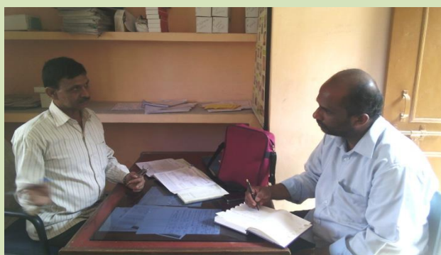
Executive Director of KNEUS program discuss with KNEUS staff at Bhangel DMC

Ever since KNEUS signed Memorandum of Understanding (MoU) with District Tuberculosis Officer (DTO) on behalf of District Health Society (DHS) on 29.10.2003 it has registered and treated 26,500 Tuberculosis patients so far in this colony and villages till 2016 December. Year- wise details are given below.