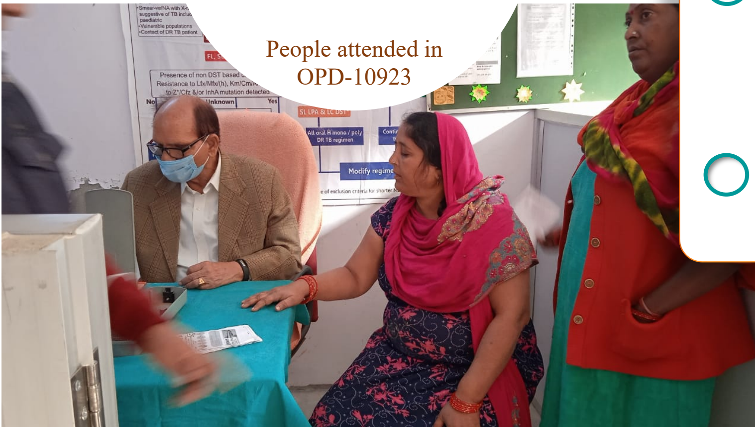
People attended in OPD-10923

Kusht Nyantran Evum Unmoolan Samiti (KNEUS) is running two community based health care centers at Noida and Salarpur in Gautam Buddha Nagar district. Qualified doctors, paramedical workers, lab technicians, nurses and social workers are rendering their services very sincerely and honestly in our centre. Along with primary check-up and treatment, diseases like TB, malaria, typhoid, diabetes, HIV are also tested and treated at this center. The center is providing qualitative primary health care services to the people of urban slums especially to the poor, marginalized and vulnerable groups. Early detection and treatment of Tuberculosis as well as regular community awareness through awareness programs. A large population of Gautam Budh Nagar has availed our primary health care services. Every year around 10000 patients are seen in our OPD. Since the year 2003 to till date 623332 people have visited our center. Looking at the problems of the people, digital X-ray machine and lab facilities are available at charitable rates..